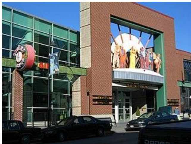
Negro League Baseball Museum and American Jazz Museum

boundary of equal danger and power. Here at midcentury, the city's white leaders laid out the redline banking districts that imperiled and marginalized the city's dynamic Black neighborhoods. There is no east-bound line for the streetcar. But the stop at MetroCenter on 12 th Street can connect you with the #8 bus line, also free, to drop you off ten minutes later in the historic 18 th and Vine Jazz District.