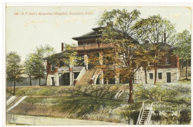
Eleanor Taylor Bell Hospital

treaty. (Recognition of the harms associated with many such actions appears in the land acknowledgement for this meeting.) The hospital and its affiliated nursing and medical schools soon grew and in 1924 moved a mile south to their present location on Rainbow Boulevard; later, a third iteration of the Eleanor Taylor Bell Hospital was created, which is now embedded within the ever-growing complex of the University of Kansas Medical Center and University of Kansas Hospital. You can still trace the outlines of this third Bell Hospital in the naming system for rooms like BH4011.