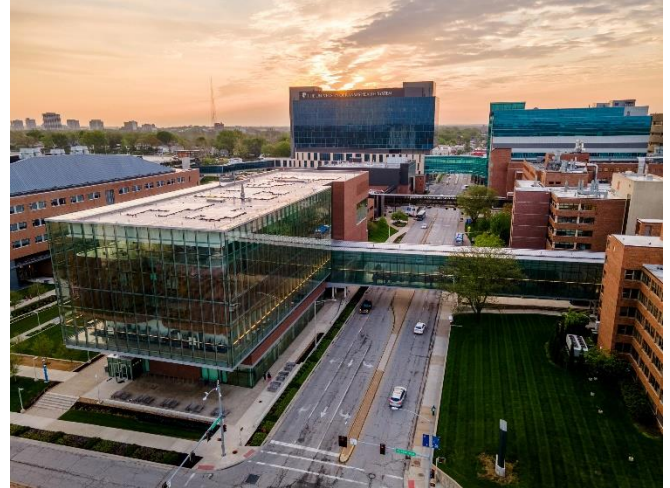
Health Education Building, KUMC

Center’s new Health Education Building (HEB) and known locally as The Cube.