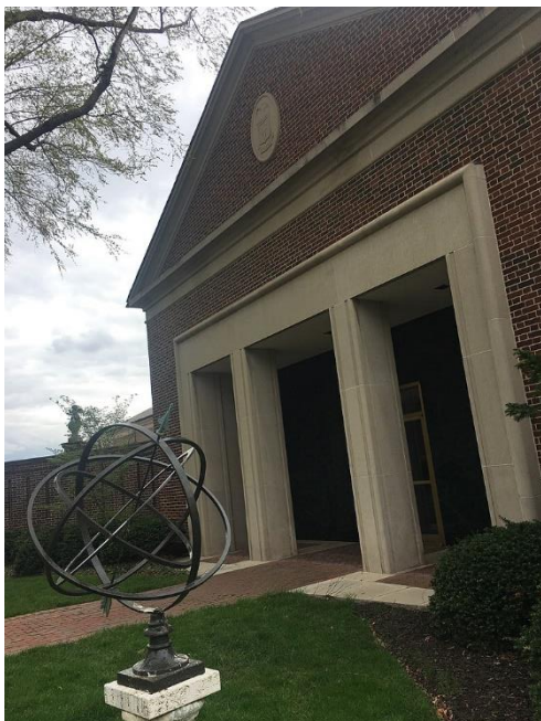
Linda Hall Library

Linda Hall Library is an independent research library of science that incorporates, in part, the former library of the American Academy of Arts and Sciences, as well as the library of the Franklin Institute. More information on the collections can be found at https://www.lindahall.org/research/collections/collections-overview/ . Scholars wishing to arrange a research visit should email collections@lindahall.org at least 48 hours in advance.